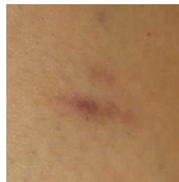
3 months with SUPER SERUM ADVANCE+ applied twice daily