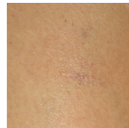
6 months with SUPER SERUM ADVANCE+ applied twice daily for the first 3 months and once daily for the following 3 months