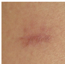
3 months - Control