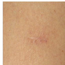
6 months - Control